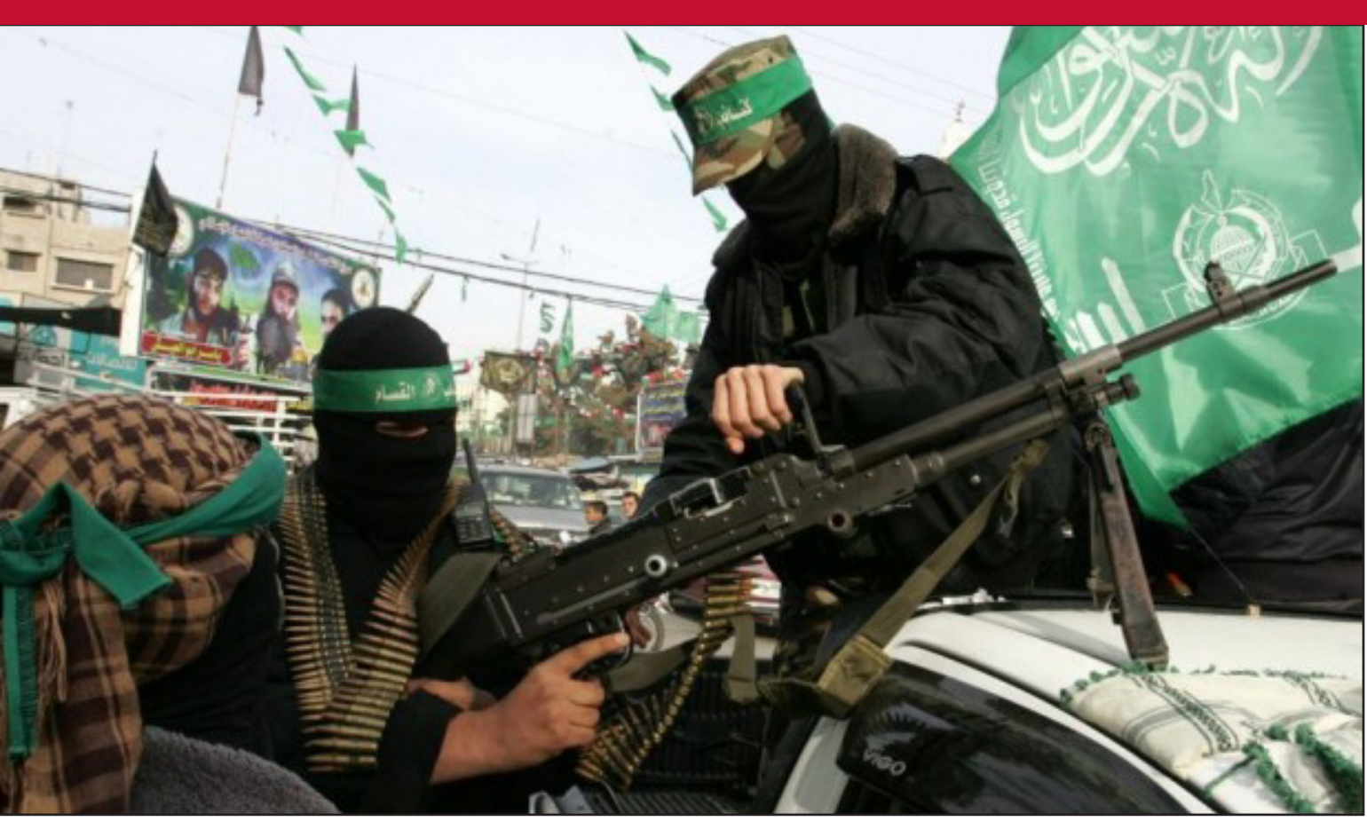
Members of Hamas's al-Oassam Brigades in Rafah, December 2011