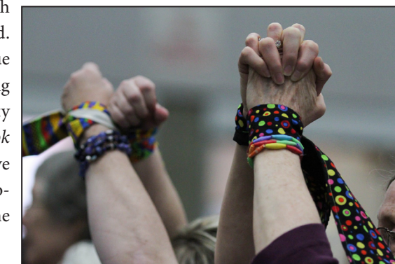
Demonstrators bind their wrists while singing as delegates enter the May 17 afternoon plenary session. They are protesting what they believe is an attempt to silence LGBTQ voices during the 2016 United Methodist General Conference in Portland, Oregon.