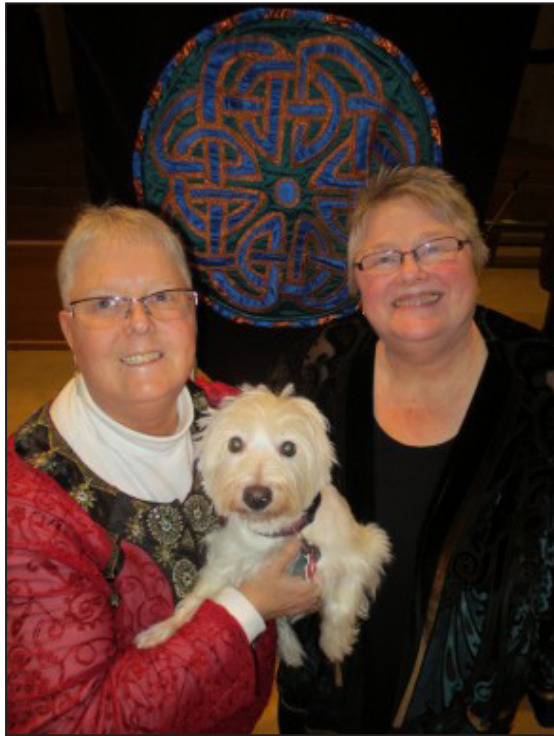
The lesbian clergy couple, in a photo they submitted to United Methodist News Service.