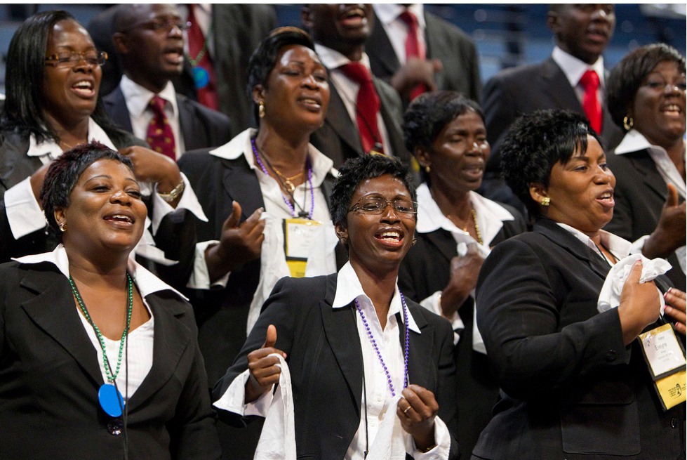
The National Choir of the West African nation of the Ivory Coast singing during worship at the 2012 UMC General Conference

Recent membership statistics show that United Methodism is shifting away from American liberal Protestantism towards a new global identity.