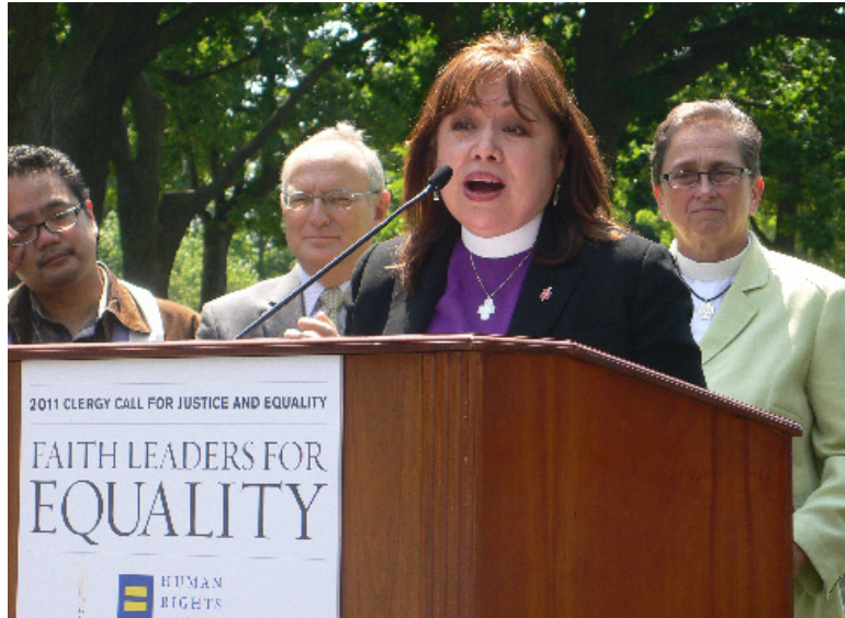
Bishop Minerva Carcaño Addresses a Human Rights Campaign Press Conference on Capitol Hill