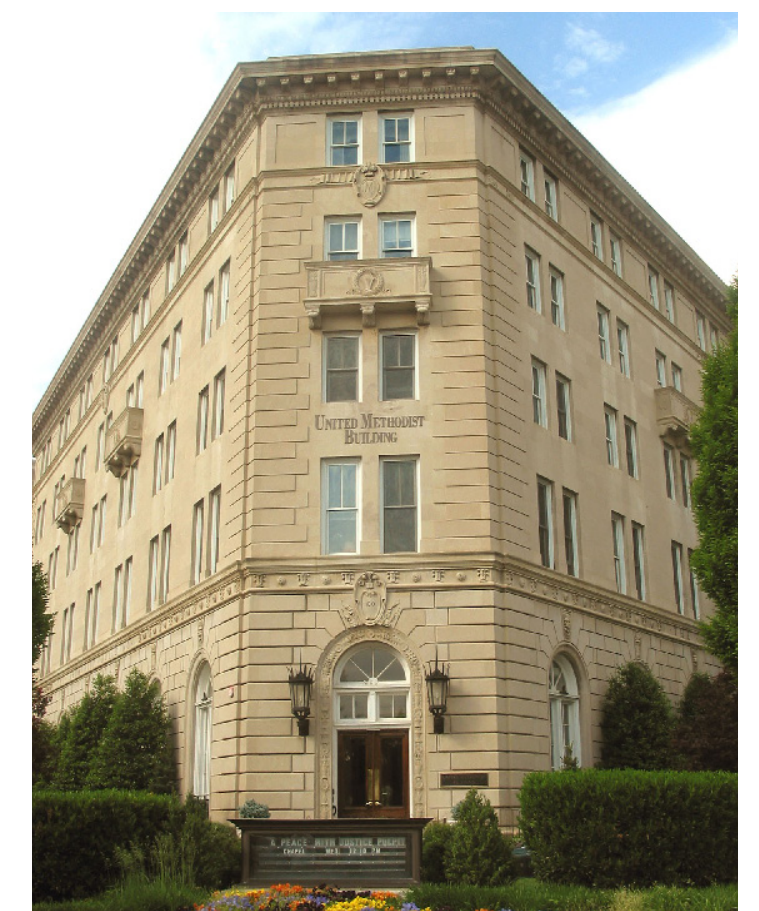
The United Methodist Building on Capitol Hill hosts the lobbying offices of several religious groups, many of whom share politically liberal policy positions. (GBCS)

Medicaid, unemployment assistance, SNAP, TANF, SSI, and Pell grants. Such