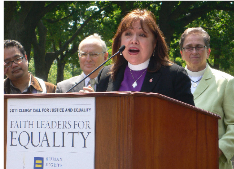
Bishop Minerva Carcaño Addresses a Human Rights Campaign Press Conference on Capitol Hill

United Methodist Bishop Minerva Carcaño of the Desert Southwest Conference joined the Capitol Hill press conference. A chief focus was repealing the Defense of Marriage Act (DOMA) – which allows states to choose whether or not to recognize same-sex marriages from other states – and promoting the Employment Non-Discrimination Act (ENDA), the Student Non-Discrimination Act and the Safe Schools Improvement Act.