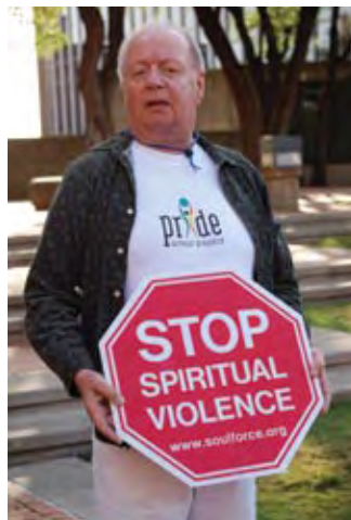
Photo: Activist protesting Biblical standards outside the convention center. (IRD/Loralei Coyle)

• Demand that the U.S. government "drop pending charges against other persons" if their