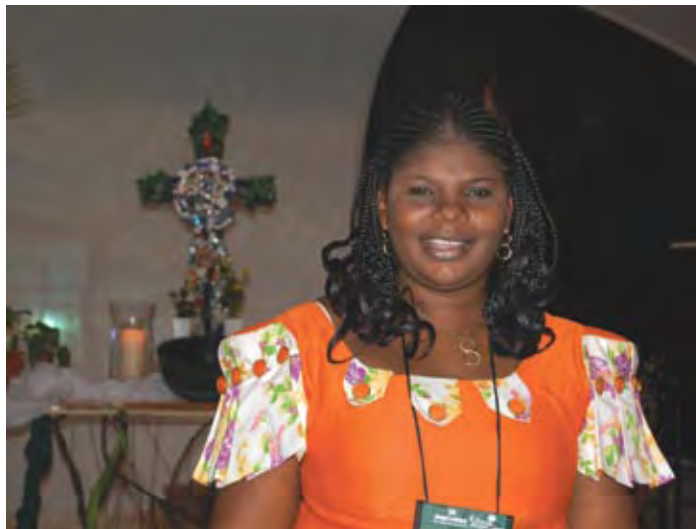
Photo: A delegate from the Congo in front of the General Conference alter.

Some African delegates had been given plane tickets mandating their departure before the end of General Conference,