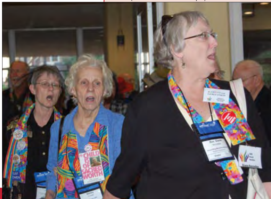
Photo: Activists protest the vote maintaining the Biblical standards on marriage & sex.