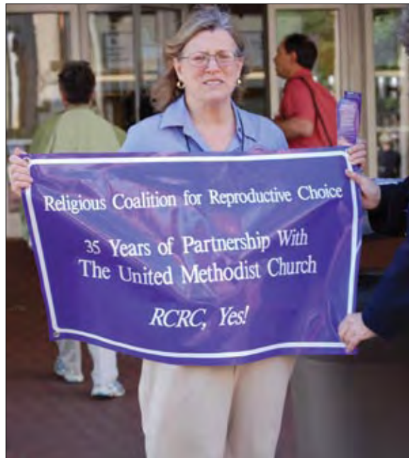
Photo: A lobbyist for RCRC in front of the Convention Center. (IRD/Loralei Coyle)

RCRC made a huge effort to woo delegates, but almost certainly would have been defeated if the vote had been taken earlier.