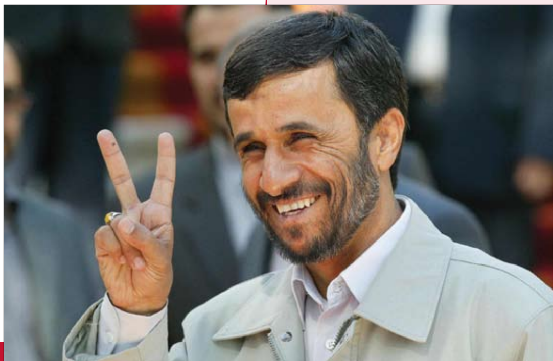
Iranian President Mahmoud Ahmadinejad

ACTION: Talk with friends in your church's United Methodist Women. Remind them that any undesignated giving to United Methodist Women can be used for political events like this, and each woman has the right to designate her gifts for specific Christian missions and ministries.