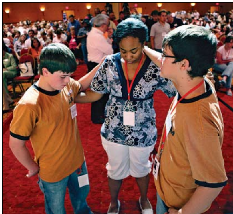
Youth praying at the conference.

ACTION: Find out more about Aldersgate Renewal Ministries: 121 East Avenue, Goodlettsville, TN 37072. (877) 857-9372. www.aldersgaterenewal.org .