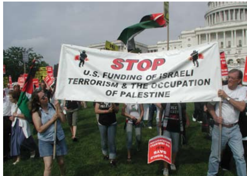
The UM Women's Division participated in the pro-Palestinian rally.